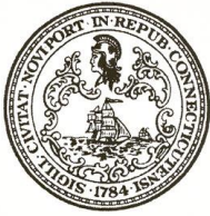
Justin Elicker Mayor