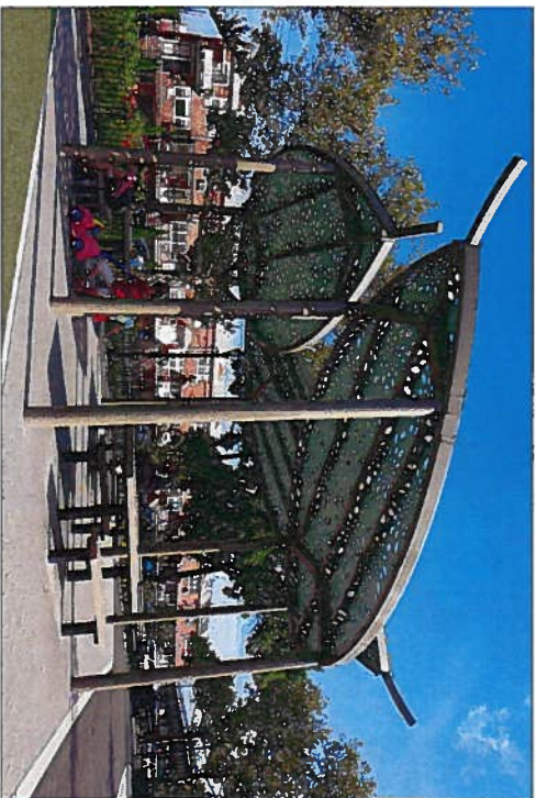
Precedent Image: leaf pavilion