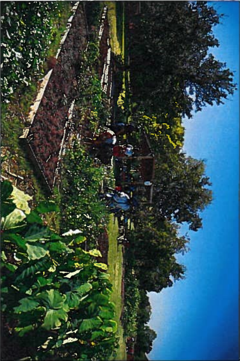
Precedent Image: community garden

Concept Plan SCALE 1" = 40' 0 40 80 120 feet N