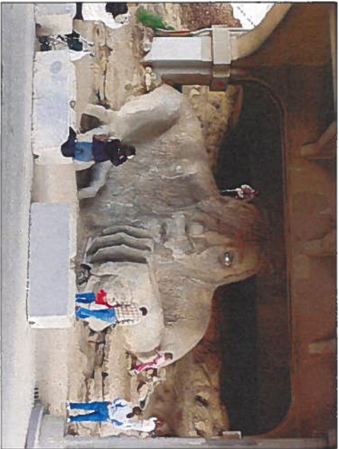
Precedent Images- climbable sculptures