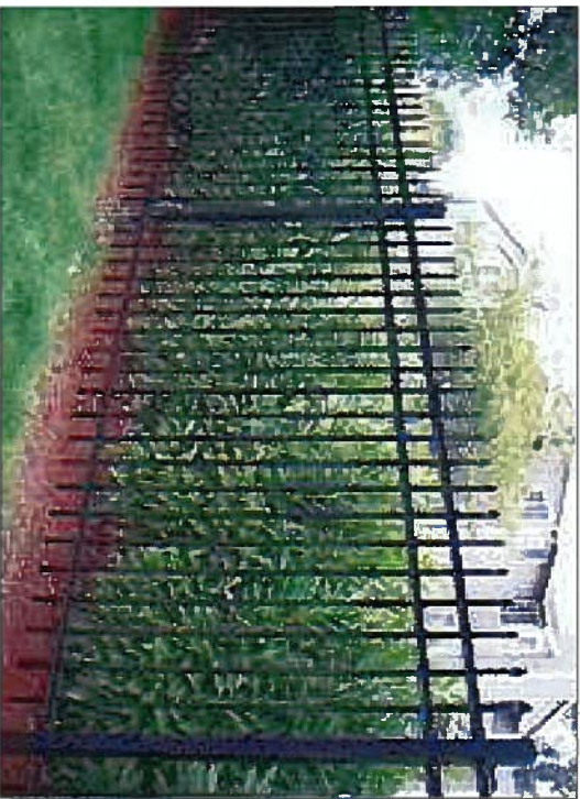
Precedent Image: decorative metal fence with shrub buffer