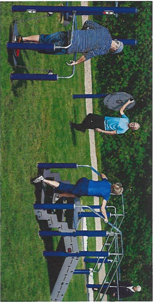
Fitness Equipment for Seniors