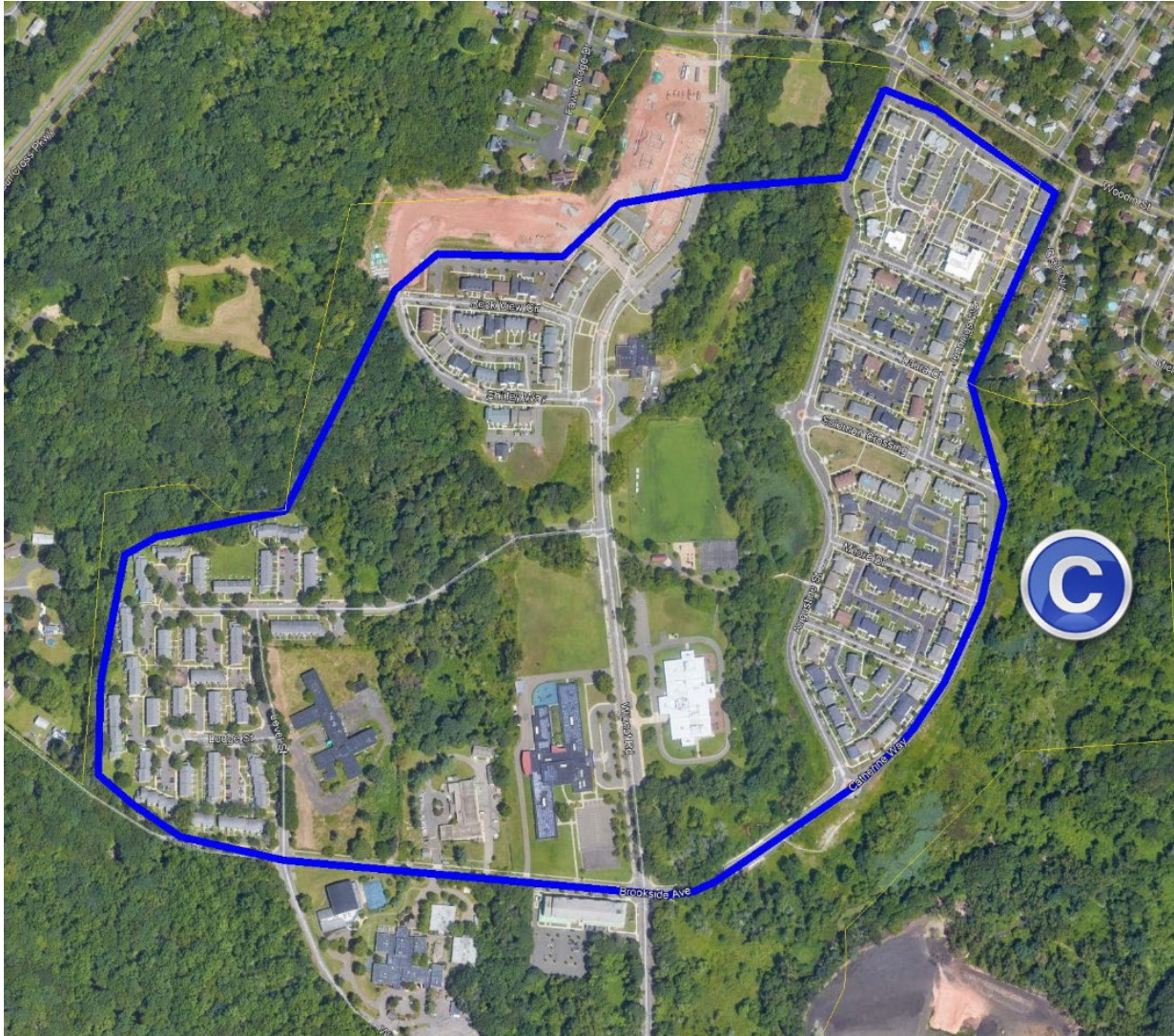
Figure 4: Area C = 0.19 square miles