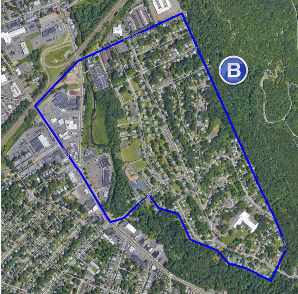
Figure 3: Area B = 0.25 square miles