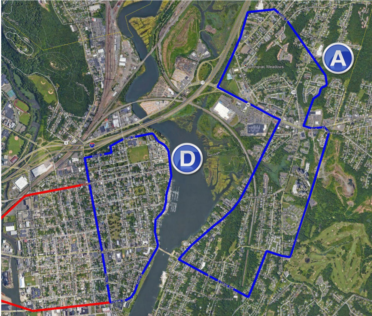
Figure 2: Area A = 0.75 square miles